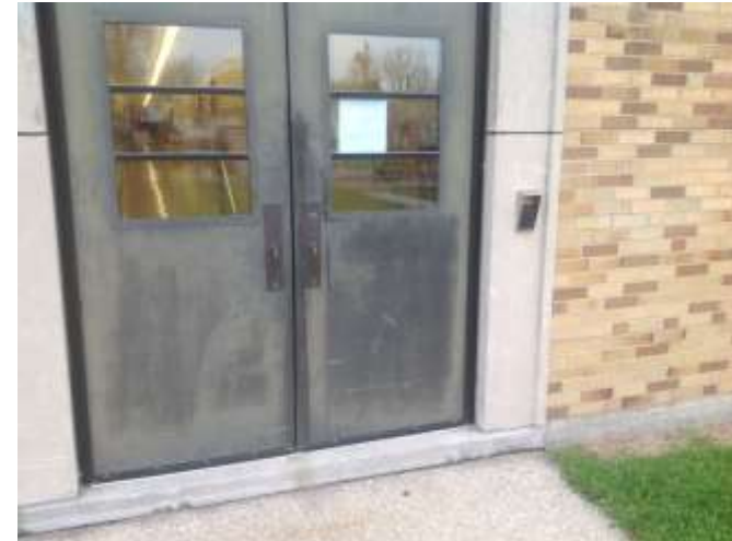
New Exterior Doors