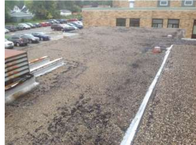
New Roof/ Restoration