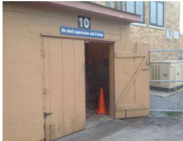
Permanent Vestibule At Back Door Parking Lot